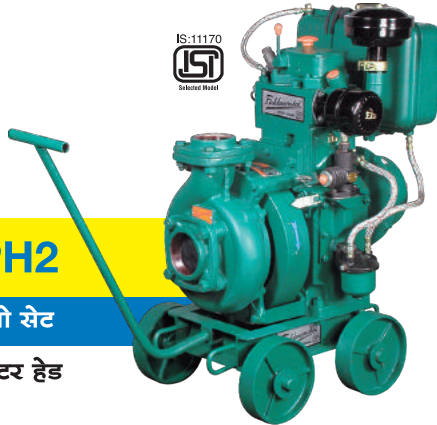
GF 65 MPH2