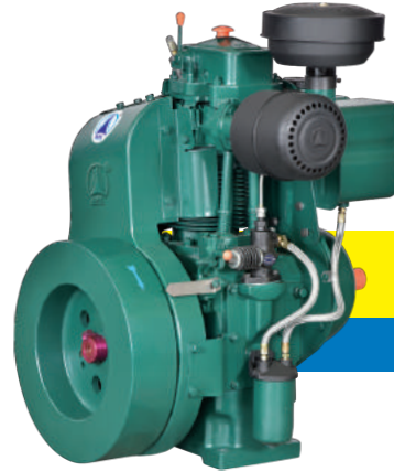
GFA 5 BD