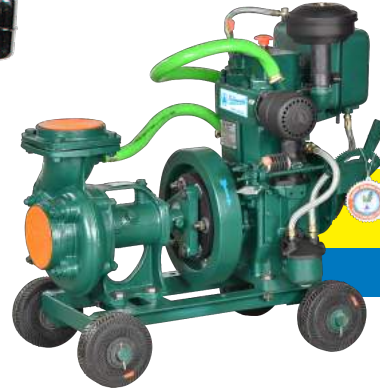
GF 5 HS