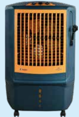
Sheetal Leher F75L