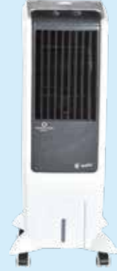
Sheetal Leher BIDT25L