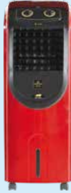
Sheetal Leher BD20L