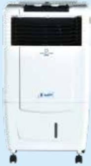
Sheetal Leher BID30L / BID40L