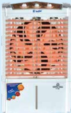
Sheetal Leher F18L