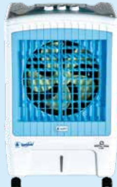
Sheetal Leher F20L